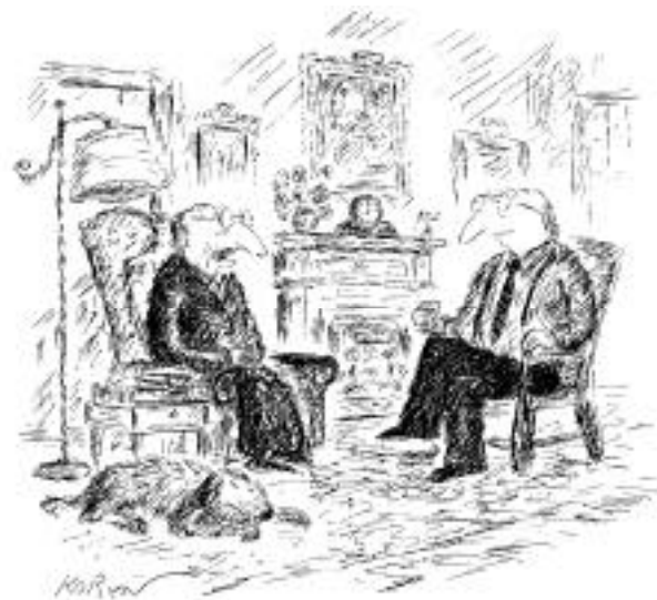
"Son, now that you've turned sixty there are a few things you should know about the family."

The Third National Conference on Black Philanthropy Detroit Marriott Renaissance Center, Detroit, MI National Center For Black Philanthropy, Inc., 202/530-9770